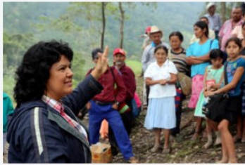
Berta Cáceres.

COPINH was founded in 1993 to defend indigenous Lenca culture, territorial rights and natural resources. Through COPINH, Lenca communities have stopped logging corporations' destruction of their homes, and have organized in a way that challenges patriarchy and