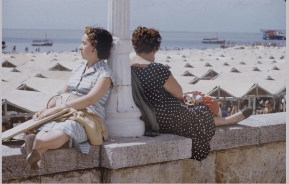
MAR DEL PLATA, ARGENTINA, 1958.